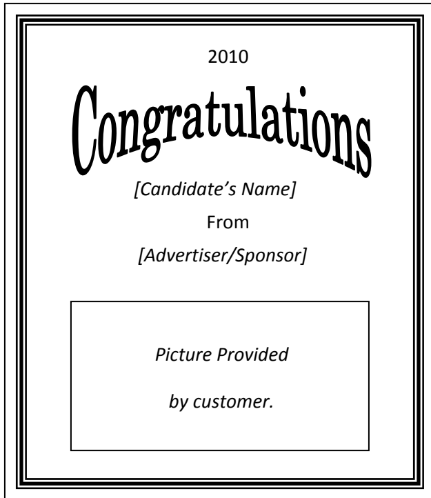
Full Page - Option A

Advertiser/Sponsor is highly encouraged to submit personalized layout. Otherwise, optional layouts can be selected from the templates below: