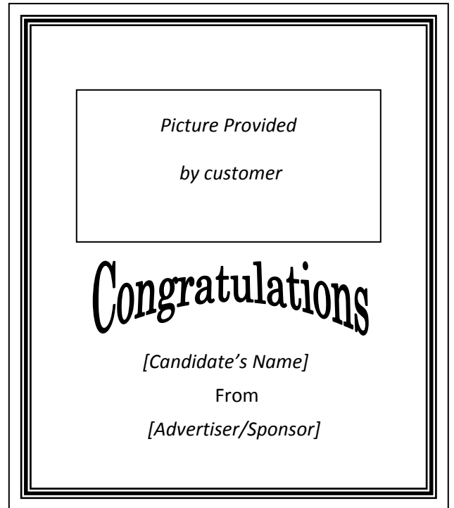
Full Page - Option B